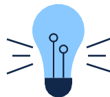
To Turn Market Drawdowns Into Opportunity

Strong Recent Returns Lower Potential Returns Higher Potential Risk